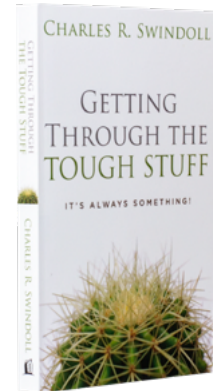
Getting Through the Tough Stuff by Charles R. Swindoll softcover book

For these and related resources, visit www.insightworld.org/store or call USA 1-800-772-8888 • AUSTRALIA +61 3 9762 6613 • CANADA 1-800-663-7639 • UK +44 1306 640156