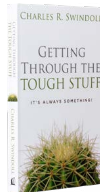
Getting Through the Tough Stuff by Charles R. Swindoll softcover book

For these and related resources, visit www.insightworld.org/store or call USA 1-800-772-8888 • AUSTRALIA +61 3 9762 6613 • CANADA 1-800-663-7639 • UK +44 1306 640156