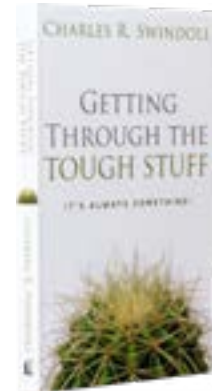
Getting Through the Tough Stuff by Charles R. Swindoll softcover book

For these and related resources, visit www.insightworld.org/store or call USA 1-800-772-8888 • AUSTRALIA +61 3 9762 6613 • CANADA 1-800-663-7639 • UK +44 1306 640156