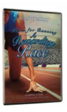
Rules for Running a Rewarding Race by Charles R. Swindoll CD message

For these and related resources, visit www.insightworld.org/store or call USA 1-800-772-8888 • AUSTRALIA +61 3 9762 6613 • CANADA 1-800-663-7639 • UK +44 1306 640156