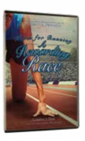
Rules for Running a Rewarding Race by Charles R. Swindoll CD message

For these and related resources, visit www.insightworld.org/store or call USA 1-800-772-8888 • AUSTRALIA +61 3 9762 6613 • CANADA 1-800-663-7639 • UK +44 1306 640156