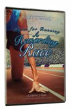
Rules for Running a Rewarding Race by Charles R. Swindoll CD message

For these and related resources, visit www.insightworld.org/store or call USA 1-800-772-8888 • AUSTRALIA +61 3 9762 6613 • CANADA 1-800-663-7639 • UK +44 1306 640156