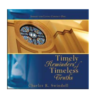
Timely Reminders of Timeless Truths by Charles R. Swindoll single CD