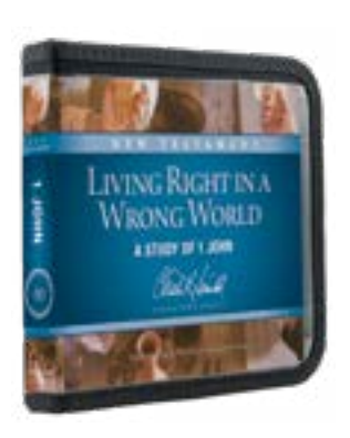
Living Right in a Wrong World by Charles R. Swindoll CD series