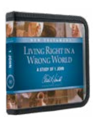
Living Right in a Wrong World by Charles R. Swindoll CD series