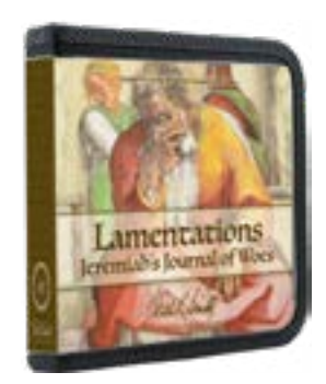
Lamentations: Jeremiah's Journal of Woes by Charles R. Swindoll CD series