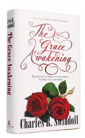
The Grace Awakening by Charles R. Swindoll hardcover book