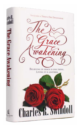
The Grace Awakening by Charles R. Swindoll hardcover book