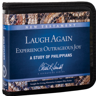
Laugh Again: Experience Outrageous Joy by Charles R. Swindoll CD series