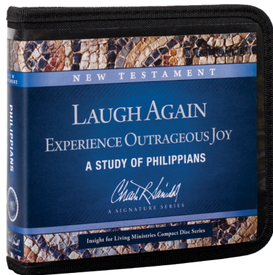
Laugh Again: Experience Outrageous Joy by Charles R. Swindoll CD series