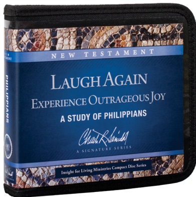
Laugh Again: Experience Outrageous Joy by Charles R. Swindoll CD series