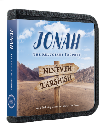
Jonah: The Reluctant Prophet by Charles R. Swindoll CD series