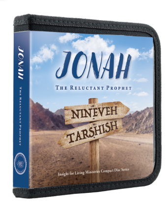
Jonah: The Reluctant Prophet by Charles R. Swindoll CD series