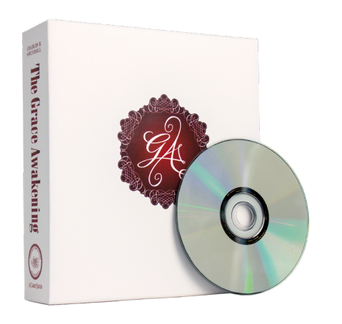
The Grace Awakening by Charles R. Swindoll CD series