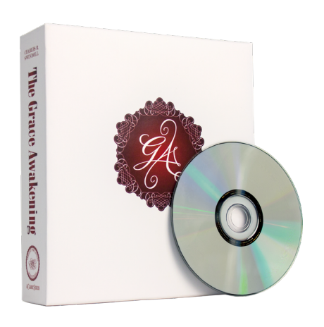
The Grace Awakening by Charles R. Swindoll CD series