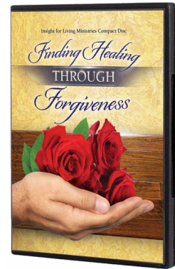
Finding Healing Through Forgiveness by Charles R. Swindoll CD series

For these and related resources, visit insightworld.org/store or call USA 1-800-772-8888 • AUSTRALIA +61 3 9762 6613 • CANADA 1-800-663-7639 • UK +44 1306 640156