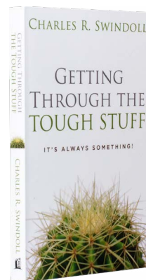
Getting Through the Tough Stuff by Charles R. Swindoll softcover book

For these and related resources, visit www.insightworld.org/store or call USA 1-800-772-8888 • AUSTRALIA +61 3 9762 6613 • CANADA 1-800-663-7639 • UK +44 1306 640156