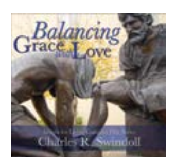
Balancing Grace with Love by Charles R. Swindoll CD series

For these and related resources, visit www.insightworld.org/store or call USA 1-800-772-8888 • AUSTRALIA +61 3 9762 6613 • CANADA 1-800-663-7639 • UK +44 1306 640156