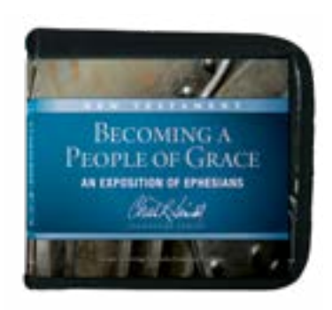
Becoming a People of Grace by Charles R. Swindoll CD series