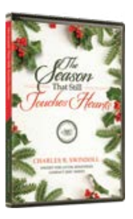
The Season That Still Touches Hearts by Charles R. Swindoll CD series

For these and related resources, visit www.insightworld.org/store or call USA 1-800-772-8888 • AUSTRALIA +61 3 9762 6613 • CANADA 1-800-663-7639 • UK +44 1306 640156