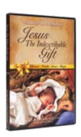
Jesus: The Indescribable Gift by Charles R. Swindoll CD series