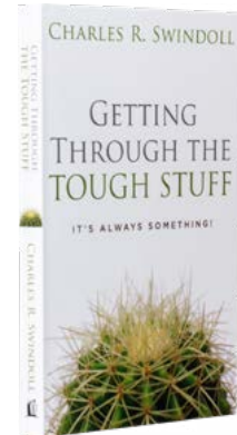
Getting Through the Tough Stuff by Charles R. Swindoll softcover book

For these and related resources, visit www.insightworld.org/store or call USA 1-800-772-8888 • AUSTRALIA +61 3 9762 6613 • CANADA 1-800-663-7639 • UK +44 1306 640156