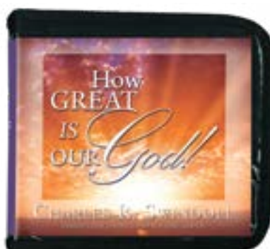
How Great Is Our God by Charles R. Swindoll CD series