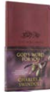
God's Word for You: An Invitation to Find the Nourishment Your Soul Needs by Charles R. Swindoll LeatherLike book

For these and related resources, visit www.insightworld.org/store or call USA 1-800-772-8888 • AUSTRALIA +61 3 9762 6613 • CANADA 1-800-663-7639 • UK +44 1306 640156