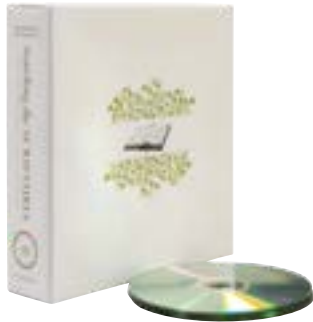
Searching the Scriptures: Find the Nourishment Your Soul Needs— A Classic Series by Charles R. Swindoll CD series