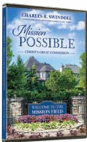
Mission Possible: Christ's Great Commission by Charles R. Swindoll CD series