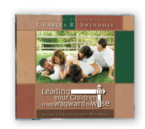
Leading Your Children from Wayward to Wise by Charles R. Swindoll CD series

For related resources, please call: USA 1-800-772-8888 AUSTRALIA 1 300 467 444 CANADA 1-800-663-7639 UK 0800 915 9364 Or visit www.insight.org or www.insightworld.org