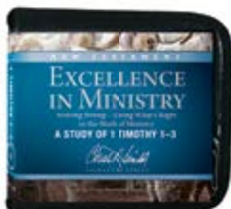
Excellence in Ministry: Starting Strong—Doing What's Right in the Work of Ministry—A Study of 1 Timothy 1–3 by Charles R. Swindoll Signature Series CD set