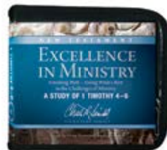
Excellence in Ministry: Finishing Well—Doing What's Best in the Challenges of Ministry—A Study of 1 Timothy 4–6 by Charles R. Swindoll Signature Series CD set

For these and related resources, visit www.insightworld.org/store or call USA 1-800-772-8888 • AUSTRALIA +61 3 9762 6613 • CANADA 1-800-663-7639 • UK +44 1306 640156