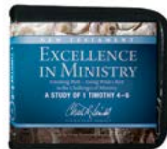
Excellence in Ministry: Finishing Well—Doing What's Best in the Challenges of Ministry—A Study of 1 Timothy 4–6 by Charles R. Swindoll Signature Series CD set

For these and related resources, visit www.insightworld.org/store or call USA 1-800-772-8888 • AUSTRALIA +61 3 9762 6613 • CANADA 1-800-663-7639 • UK +44 1306 640156