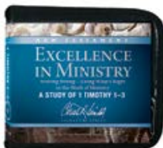
Excellence in Ministry: Starting Strong—Doing What's Right in the Work of Ministry—A Study of 1 Timothy 1–3 by Charles R. Swindoll Signature Series CD set