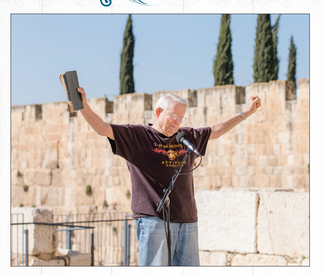
Abundant life in Christ is found through our wholehearted submission to Him and His Word.