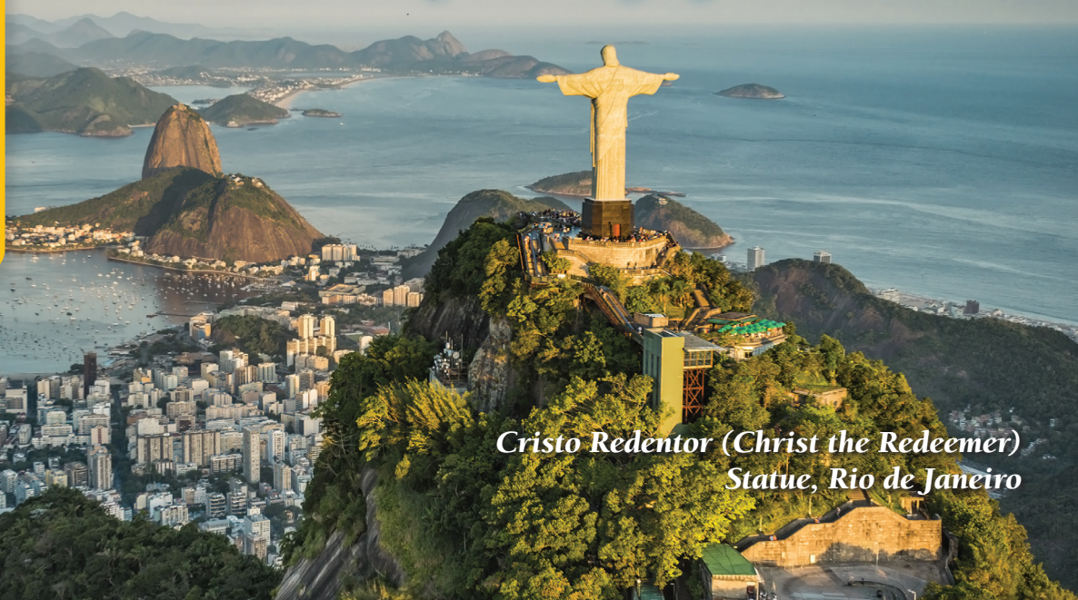
Cristo Redentor (Christ the Redeemer) Statue, Rio de Janeiro

Insight for Living Ministries in the Portuguese Language