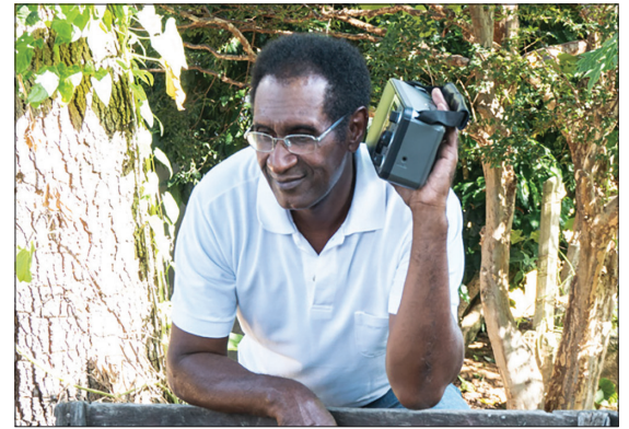
Many people living in isolated villages are now accessing the Bible teaching of RPV through the use of handheld radio devices.