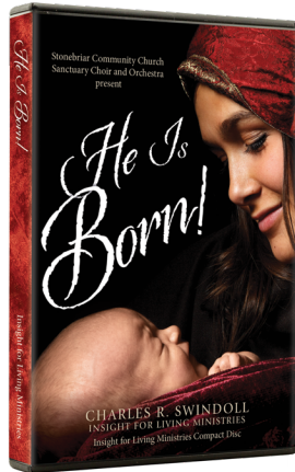
He Is Born by Stonebriar Community Church Choir and Orchestra compact disc