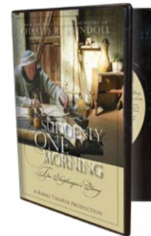
Suddenly One Morning A Radio Theater Production by Charles R. Swindoll and Insight for Living Ministries single CD

For these and related resources, visit www.insightworld.org/store or call USA 1-800-772-8888 • AUSTRALIA +61 3 9762 6613 • CANADA 1-800-663-7639 • UK +44 1306 640156