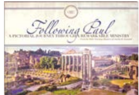
Following Paul: A Pictorial Journey Through a Remarkable Ministry by Insight for Living Ministries softcover book

For these and related resources, visit www.insightworld.org/store or call USA 1-800-772-8888 • AUSTRALIA +61 3 9762 6613 • CANADA 1-800-663-7639 • UK +44 1306 640156