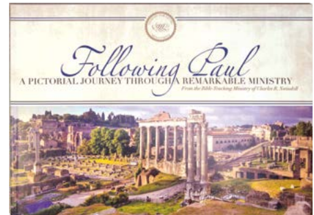
Following Paul: A Pictorial Journey Through a Remarkable Ministry by Insight for Living Ministries softcover book

For these and related resources, visit www.insightworld.org/store or call USA 1-800-772-8888 • AUSTRALIA +61 3 9762 6613 • CANADA 1-800-663-7639 • UK +44 1306 640156