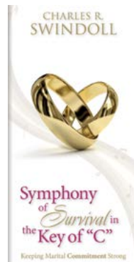
Symphony of Survival in the Key of "C": Keeping Marital Commitment Strong by Charles R. Swindoll booklet