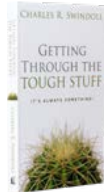
Getting Through the Tough Stuff by Charles R. Swindoll softcover book

For these and related resources, visit www.insightworld.org/store or call USA 1-800-772-8888 • AUSTRALIA +61 3 9762 6613 • CANADA 1-800-663-7639 • UK +44 1306 640156