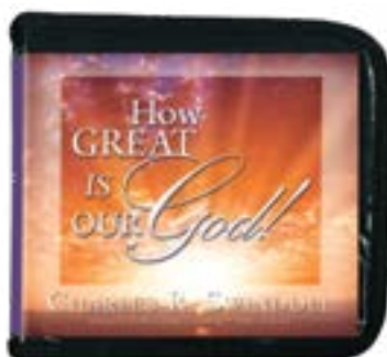
How Great Is Our God by Charles R. Swindoll CD series