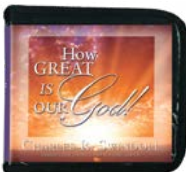
How Great Is Our God by Charles R. Swindoll CD series