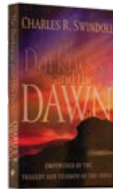
The Darkness and the Dawn by Charles R. Swindoll softcover book

For these and related resources, visit www.insightworld.org/store or call USA 1-800-772-8888 • AUSTRALIA +61 3 9762 6613 • CANADA 1-800-663-7639 • UK +44 1306 640156