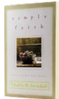
Simple Faith by Charles R. Swindoll softcover book

For these and related resources, visit www.insightworld.org/store or call USA 1-800-772-8888 • AUSTRALIA +61 3 9762 6613 • CANADA 1-800-663-7639 • UK +44 1306 640156