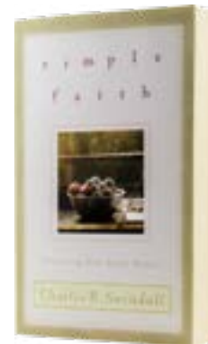
Simple Faith by Charles R. Swindoll softcover book

For these and related resources, visit www.insightworld.org/store or call USA 1-800-772-8888 • AUSTRALIA +61 3 9762 6613 • CANADA 1-800-663-7639 • UK +44 1306 640156