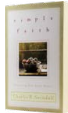
Simple Faith by Charles R. Swindoll softcover book

For these and related resources, visit www.insightworld.org/store or call USA 1-800-772-8888 • AUSTRALIA +61 3 9762 6613 • CANADA 1-800-663-7639 • UK +44 1306 640156