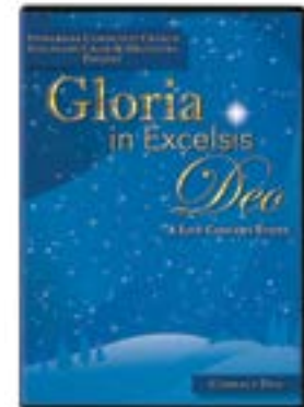
Gloria in Excelsis Deo: A Live Concert Event by Charles R. Swindoll and Stonebriar Community Church Choir and Orchestra CD

For these and related resources, visit www.insightworld.org/store or call USA 1-800-772-8888 • AUSTRALIA +61 3 9762 6613 • CANADA 1-800-663-7639 • UK +44 1306 640156