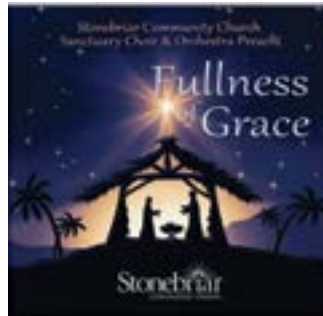
Fullness of Grace by Charles R. Swindoll and Stonebriar Community Church Choir and Orchestra CD