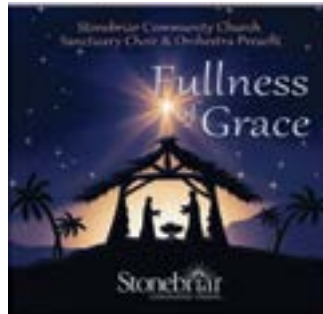
Fullness of Grace by Charles R. Swindoll and Stonebriar Community Church Choir and Orchestra CD