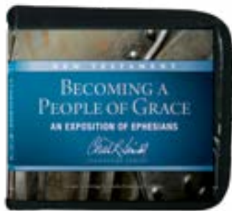
Becoming a People of Grace by Charles R. Swindoll CD series