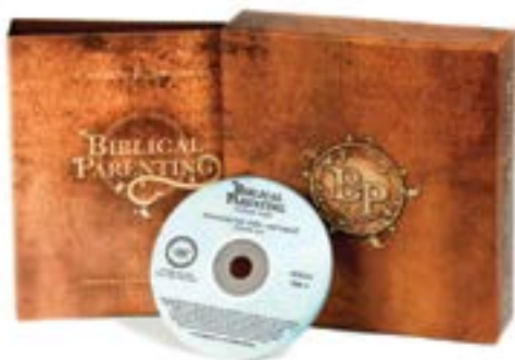
Biblical Parenting by Charles R. Swindoll CD series