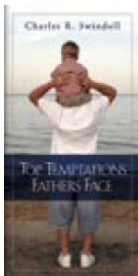
Top Temptations Fathers Face by Charles R. Swindoll booklet