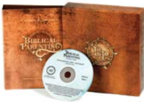
Biblical Parenting by Charles R. Swindoll CD series