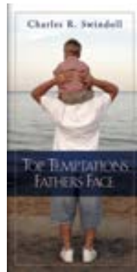
Top Temptations Fathers Face by Charles R. Swindoll booklet