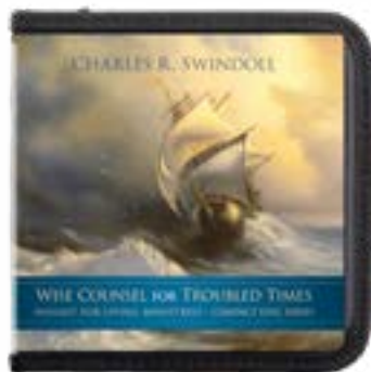
Wise Counsel for Troubled Times by Charles R. Swindoll CD series